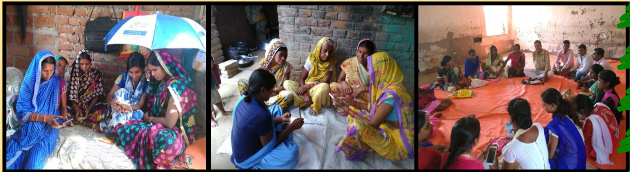
Beneficiaries training By Internet Saathi