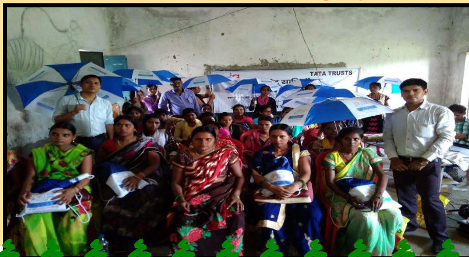
Internet Saathi Training